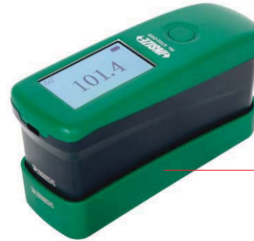
base with calibration block (included)